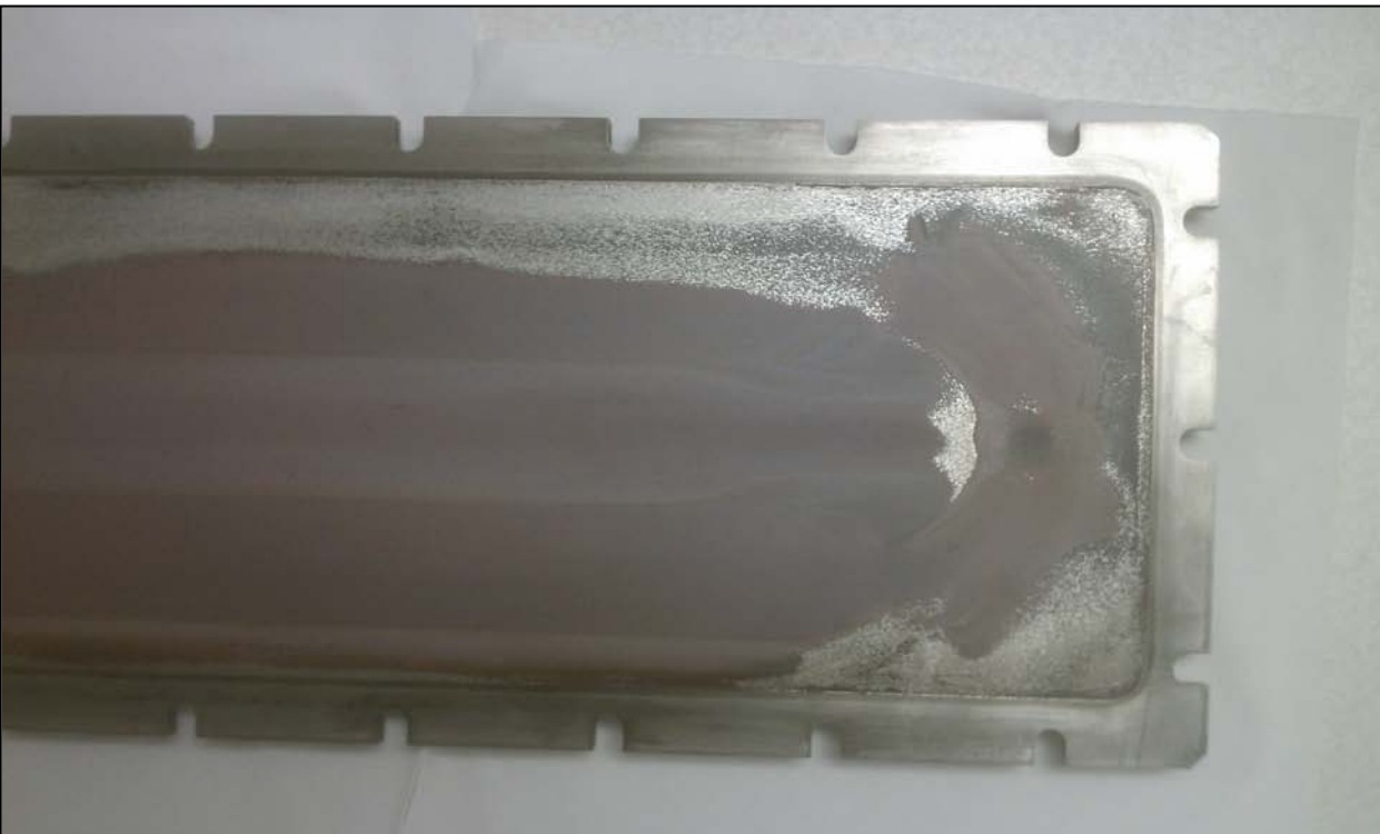
Re-deposited corrosion byproducts shown wiped away along top edge and corners of molybdenum target backing plate. Note significant pit corrosion adjacent to o-ring sealing surface, potentially compromising it's integrity.