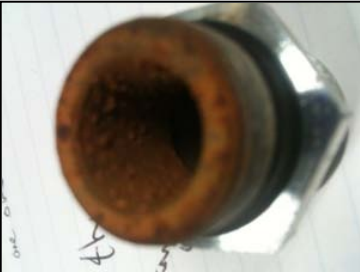
Zinc plating on steel water fitting acts as sacrificial anode when exposed to untreated, water with improper pH-water hardness balance. Without proper water treatment, removed from other surfaces (cathode body) will likely redeposit on exposed steel, increasing galvanic corrosion of the water fitting.