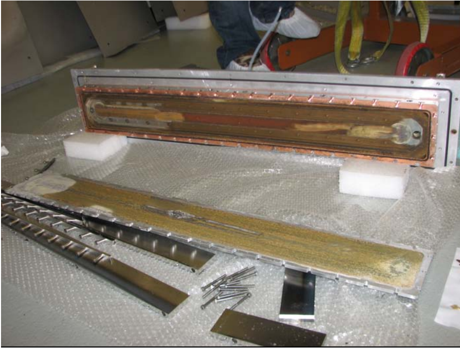
Pit corrosion of directly water cooled 6061 Al target and re-deposited material from corrosion of brass from magnet module assembly