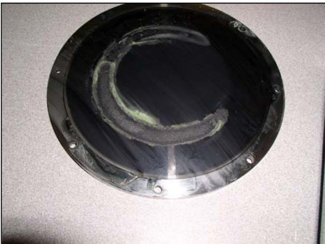
Physical erosion caused by suspended particulates and galvanic corrosion (“slime”) of molybdenum backing plate due to acidic pH

Particles within the 0.5 to 2.0 (or larger) micron size can have a “sandblasting” effect. 1 micron filters (at a minimum) should be installed on the water inlet lines to eliminate these particles. The filters need to be maintained (!) for them to remain effective.