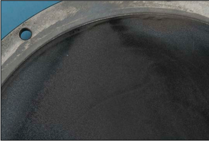
Galvanic corrosion of molybdenum target backing plate caused by ion exchange due to poor water quality.

pH is the measure of dissolved hydrogen ions. Pure water has a pH close to 7 (neutral – neither acidic or alkaline). Levels below 7 are acidic and higher levels are alkaline. Levels up to 8 can be used, depending upon the local water conditions. If the water is too acidic, it will corrode metals, cause etching and corrosion . If the water is too alkaline, it can cause scaling . The necessary pH level is closely tied to the local water hardness conditions.