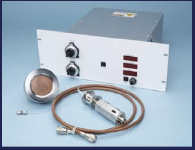
300 Series Research RF Sputtering Packages

A comprehensive documentation package is provided. Other feedthrough arrangements and cable lengths are possible – please consult the factory or visit our web site for more information. A 300 watt 13.56 MHz power supply and manually adjusted impedance matching network are integrated into a single, 19" rack mount unit. The manually adjusted impedance matching network provides the user with a broad tuning range. The network includes a series inductor with a field changeable tap and optional additional fixed shunt capacitors, enabling it to match a wide range of impedances. The RF generator allows precise power and process control from the front panel