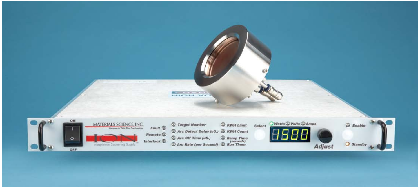
Ion™ 1500 DC Magnetron Power Supply