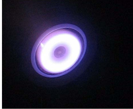
Same view & conditions as at left, but with plasma re-igniting - arcing is still decaying