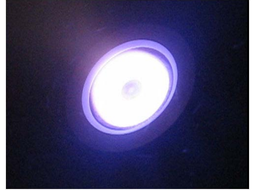
Arc suppression of Ion™ 1500 working in same environment & conditions - producing a stable plasma & good target utilization with negligible arc induced damage